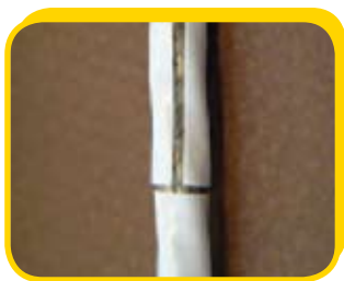
Strip & Slit

Single strand wires can be stripped in less than one second!